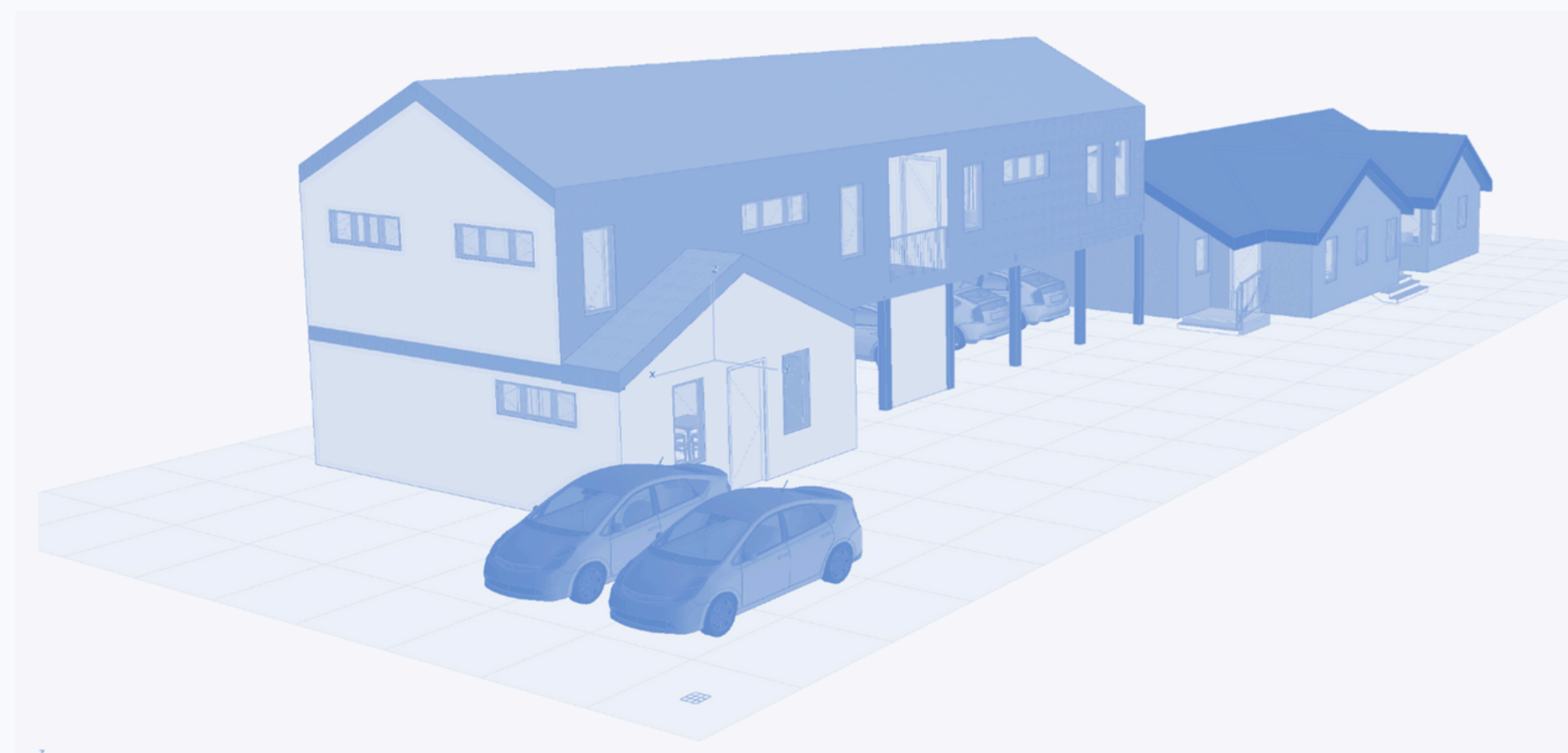
Rendering of completed project timeline